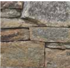
SYCAMORE COVE BLEND