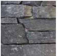
ROCKY BRANCH LEDGESTONE