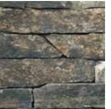
MOORE COVE LEDGESTONE