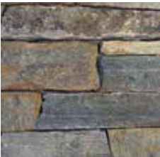
PILOT COVE LEDGESTONE