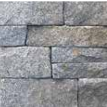
BENNETT GAP LEDGESTONE