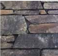
BURRELL COVE LEDGESTONE