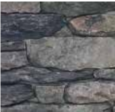
ROCKY RIDGE LEDGESTONE