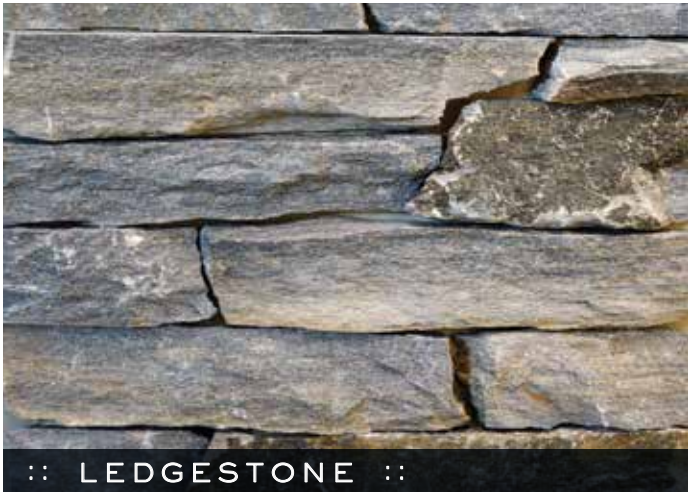
EAST FORK MEDIUM