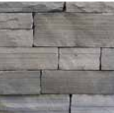
TRACE RIDGE LEDGESTONE