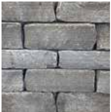
LEDFORD GRAY LEDGESTONE