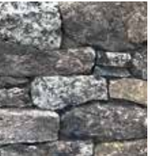
RIVER BEND LEDGESTONE