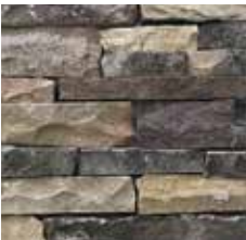
BENT CREEK BLEND