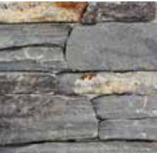
GREEN RIVER LEDGESTONE