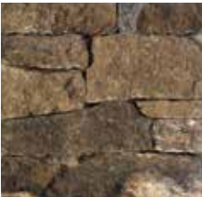
FLETCHER CREEK LEDGESTONE