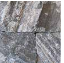
EAST FORK ASHLAR