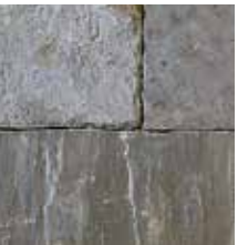
TRACE RIDGE ASHLAR