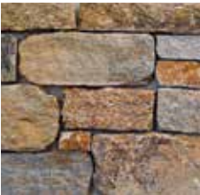
TABLE ROCK LEDGESTONE