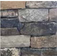
SOUTH SLOPE BLEND