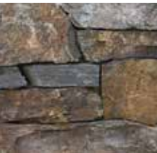
BURRELL COVE BLEND