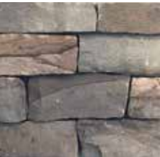
SANDY BOTTOM LEDGESTONE