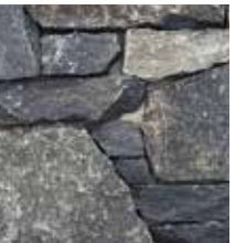
MOUNT MITCHELL BLEND