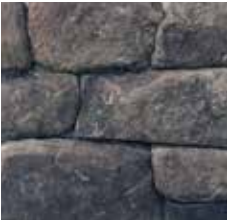
AVERY CREEK LEDGESTONE