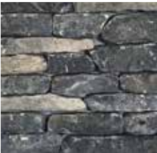
LAUREL MOUNTAIN THIN LEDGESTONE