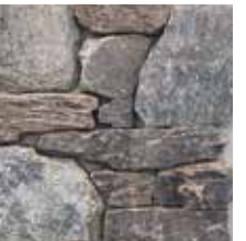
OLD RIVER BLEND