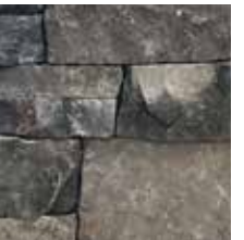
BROAD RIVER BLEND