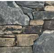
FOSTER CREEK BLEND