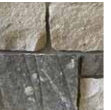
SOUTH MOUNTAIN ASHLAR