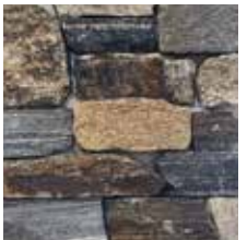
GRASSY CREEK BLEND