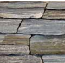
DEEP GAP LEDGESTONE