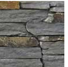
MINE MOUNTAIN LEDGESTONE