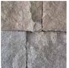
SANDY BOTTOM ASHLAR