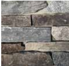
DANIEL RIDGE LEDGESTONE