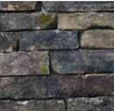
LAUREL MOUNTAIN MEDIUM LEDGESTONE