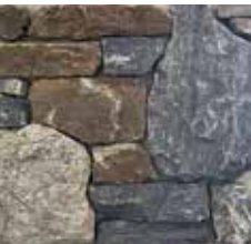
REEDY FORK BLEND