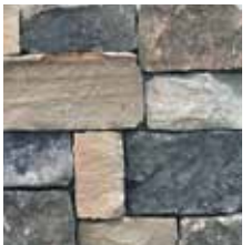
SOUTH MOUNTAIN BLEND