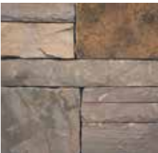
PINNACLE RIDGE BLEND