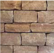
LEDFORD BROWN LEDGESTONE