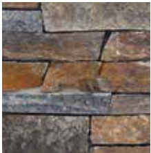
FARLOW GAP LEDGESTONE