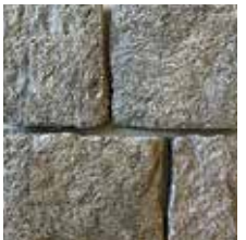
TABLE ROCK ASHLAR