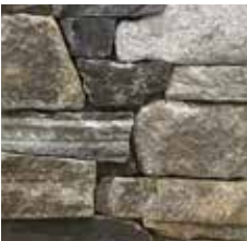
DAVIDSON RIVER BLEND