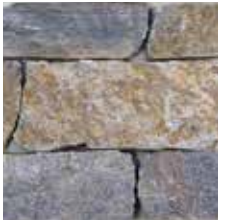
EAST FORK THICK LEDGESTONE