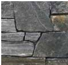
DEEP GAP BLEND