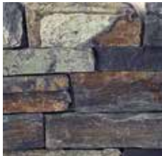
FLINT RIDGE LEDGESTONE