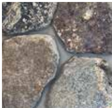
MARROW MOUNTAIN BLEND