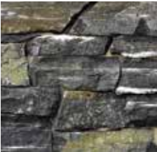
BLACK MOUNTAIN LEDGESTONE