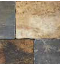
ROAN MOUNTAIN BLEND