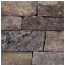
LAUREL MOUNTAIN THICK LEDGESTONE