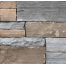
GRAVEYARD FIELD BLEND